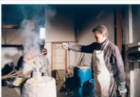
Enzo Carnebianca at work Credits: Enzo Carnebianca

Galleria Ca' d'Oro, the The Village of Merrick Park in Coral Gables is excited to unveil "Time Without Time," a solo exhibition by famed Vatican Italian artist, Enzo Carnebianca as they inaugurate an ongoing presentation of public artwork.