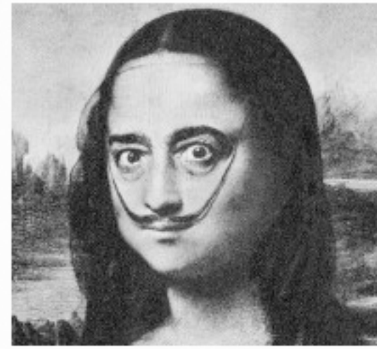
Not exactly like you remember her from Art History 101.

We all know what she looks like, but the only way to see La Joconde (that's the Mona Lisa for those of you who are Italian or art impaired) is to take a trip to the Louvre in Paris. But naturally, the most famous painting in the world has been copied and reinterpreted over the centuries. It was this trail of reimagined portraits that led to " Mona Lisa Unveiled ," an Italian exhibition that follows the history of da Vinci's renowned portrait.