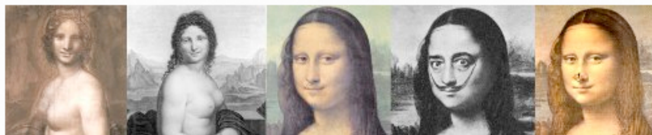
Find out all about Mona's colorful past and crooked smile.