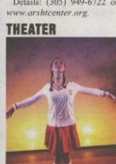
Image of a theater performance.