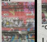
"Once Upon a Time"