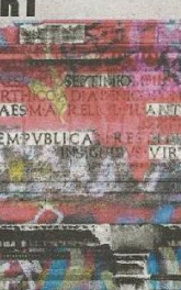
"Once Upon a Time"