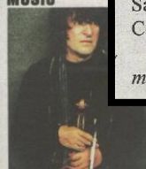
Yuri Bashmet.