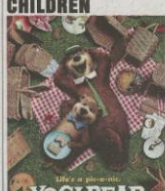
Poster for "Yogi Bear."