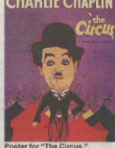
Poster for "The Circus."