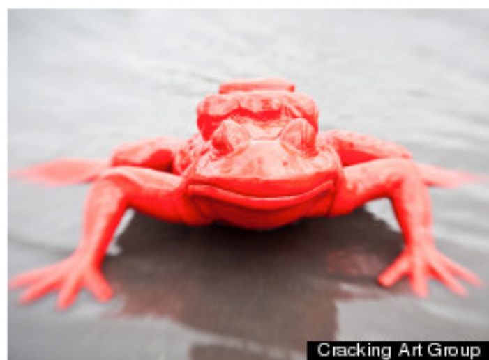
Cracking Art Group

View more videos at: http://nbcmiami.com .